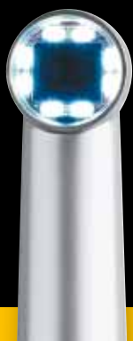
Auto-adjustable 8-LED illumination system.

Capture still images or videos with the CS 1500 camera and quickly display them on your PC or video monitor. Choose the wireless version for complete freedom of movement, or connect the camera to your computer directly via USB. The wireless CS 1500 camera supports AV and S-Video connections, eliminating the need for computers in every operatory. Whichever option you prefer, the CS 1500 camera is easy to share throughout your practice.