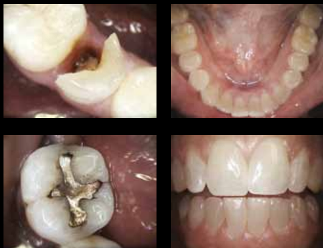
High quality images in a wide range of views.

From portraits to macro views, the camera delivers consistently clear, high-resolution images that can be easily shared with patients – so they see exactly what you see and are more likely to accept your treatment recommendations.