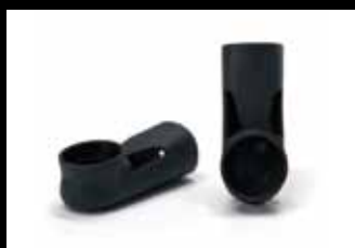
Collars for caries screening