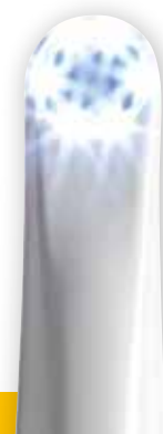
6-LED illumination system auto-adjusts to any practice lighting condition

The CS 1200 features an auto-adjustable 6-LED illumination system to ensure perfectly lit images in any lighting condition. For further flexibility, the camera also features a generous 3mm-25 mm focus range that allows users to capture a variety of views.