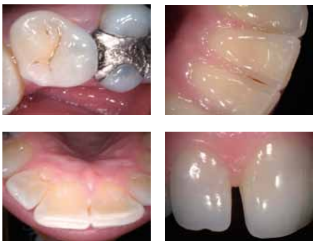
High quality images capture cracks, caries and other anomalies.

As a high-quality entry point into digital imaging, the CS 1200 combines both quality and affordability to create one exceptional camera that fits easily into any practice's budget.