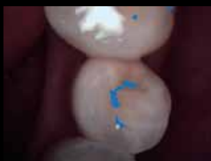
CS 1600 highlights areas of concern during screening.