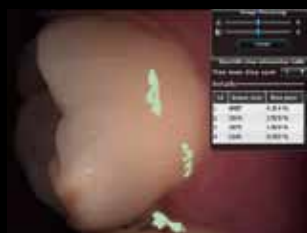
Numerical values correlate to possible caries degree.