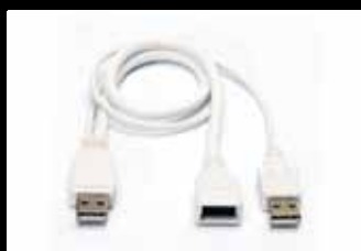
Variety of cables